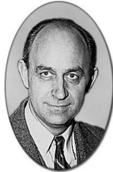
Enrico Fermi 1901-1954

Enrico Fermi was one of this country's greatest physicists.. among his accomplishments were the 1938 Nobel Prize for nuclear and particle physics and the title "Father of the Atomic Age" for his role in building the first nuclear reactor. He had a rare talent as both a gifted theorist and experimentalist. One of his legacies is the "Fermi Question," an insightful question requiring both an understanding of physics principles and estimation skills.